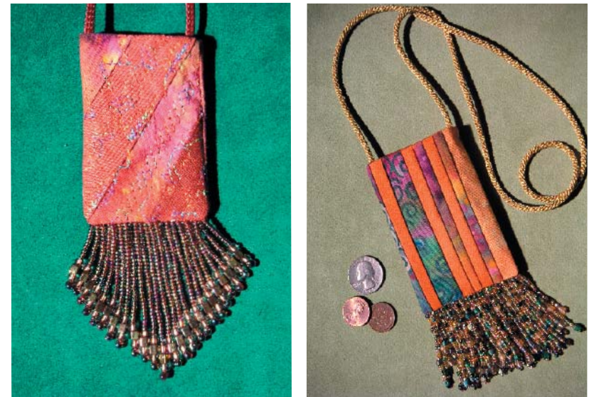
2-4" amulet necklace